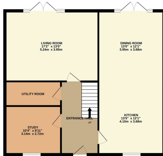
GROUND FLOOR 773 sq.ft. (71.8 sq.m.) approx.