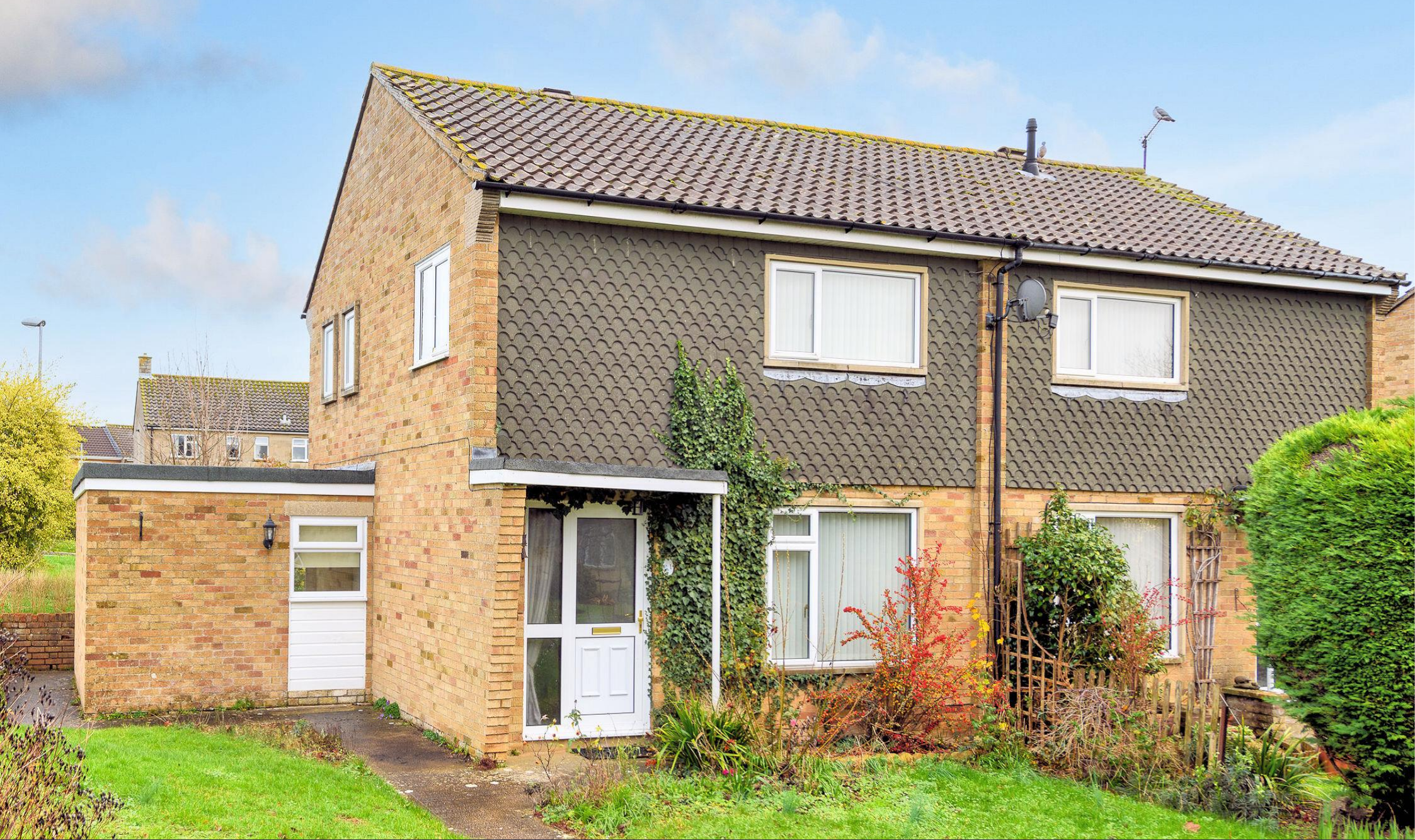
1 Peto Grove Lower Westwood, Bradford on Avon, Wiltshire, BA15 2BS