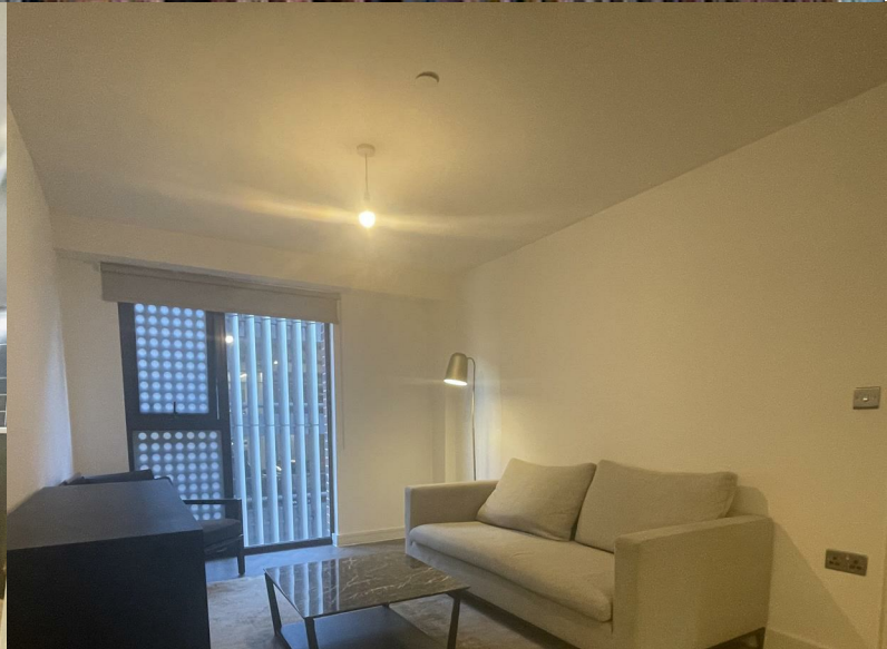
The Prestige , Liverpool, L1 4TW £1,400 Per month