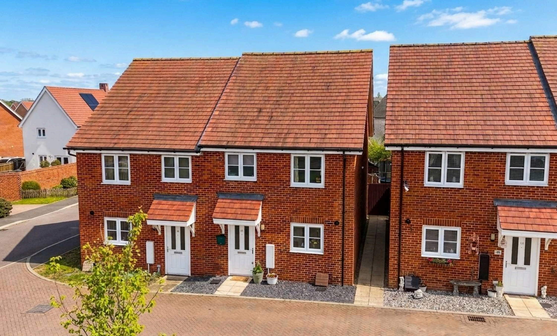
Goshawk Rise, Wymondham - NR18 9FG