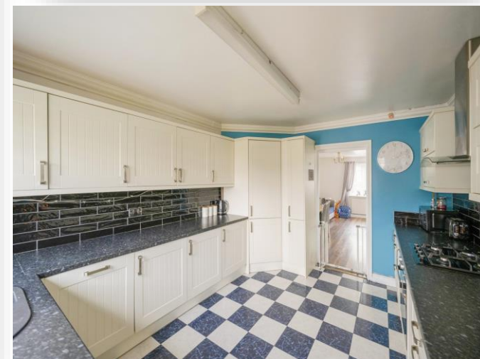
Oak Grove, Conisbrough Doncaster DN12 2HN