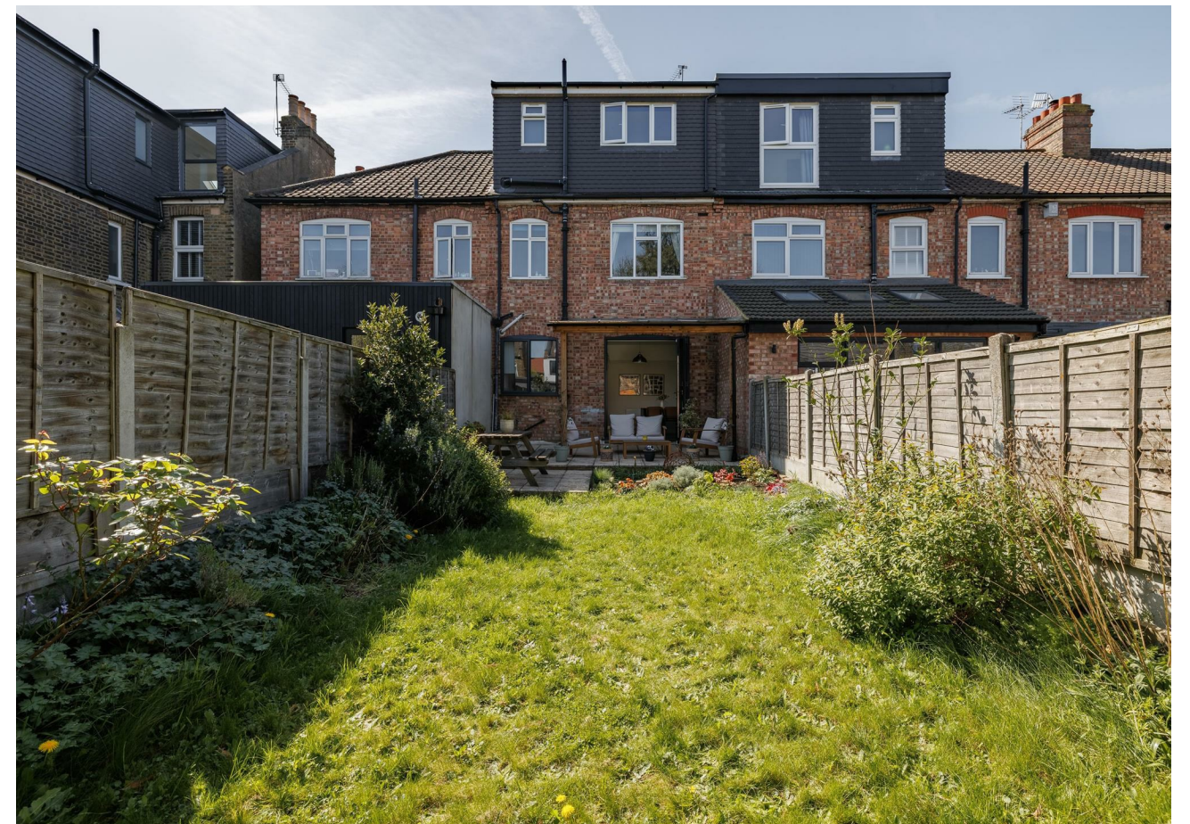
Garden 17'4" x 55'9"