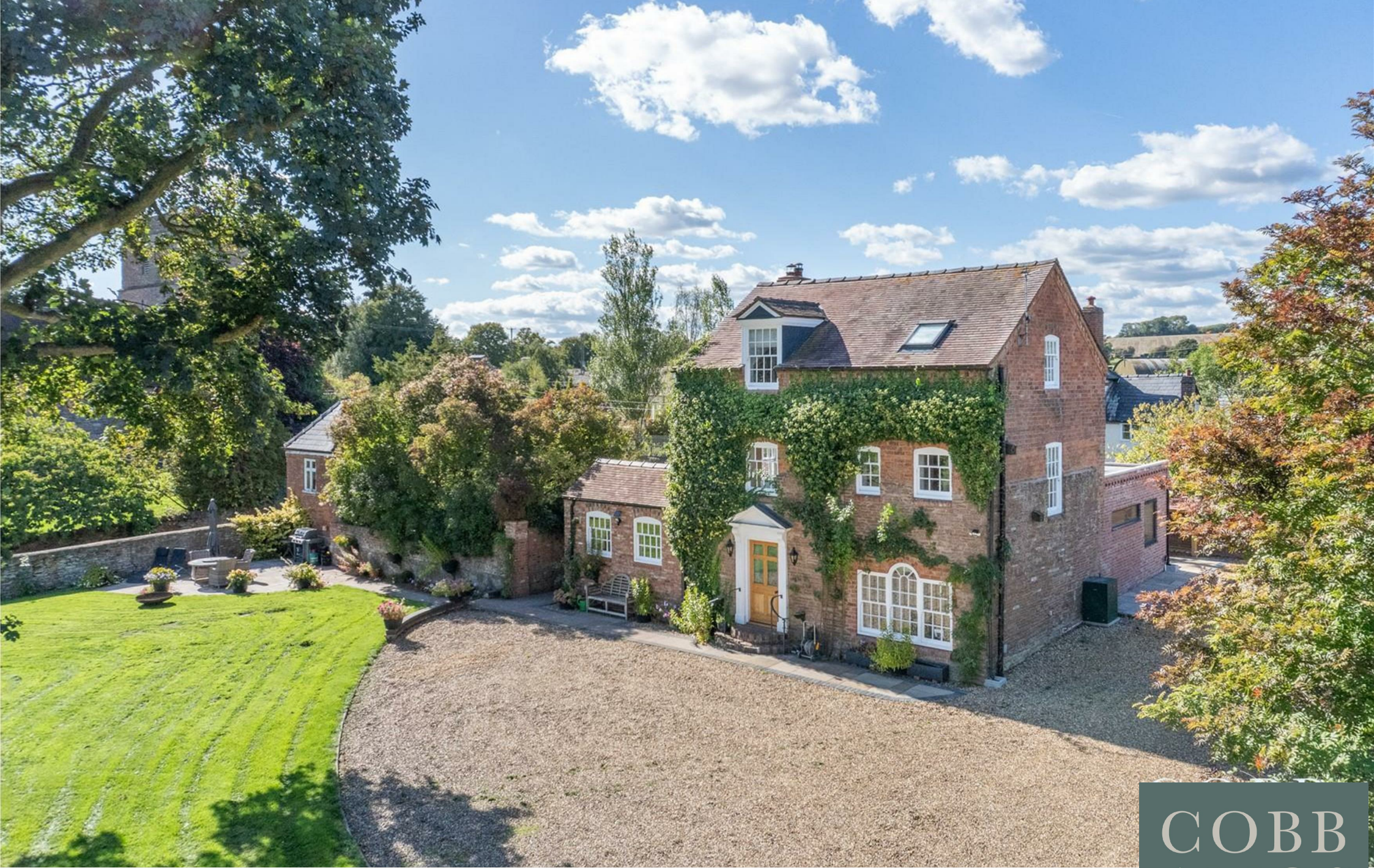
The Granary, Little Hereford, SY8 4BE Price £885,000