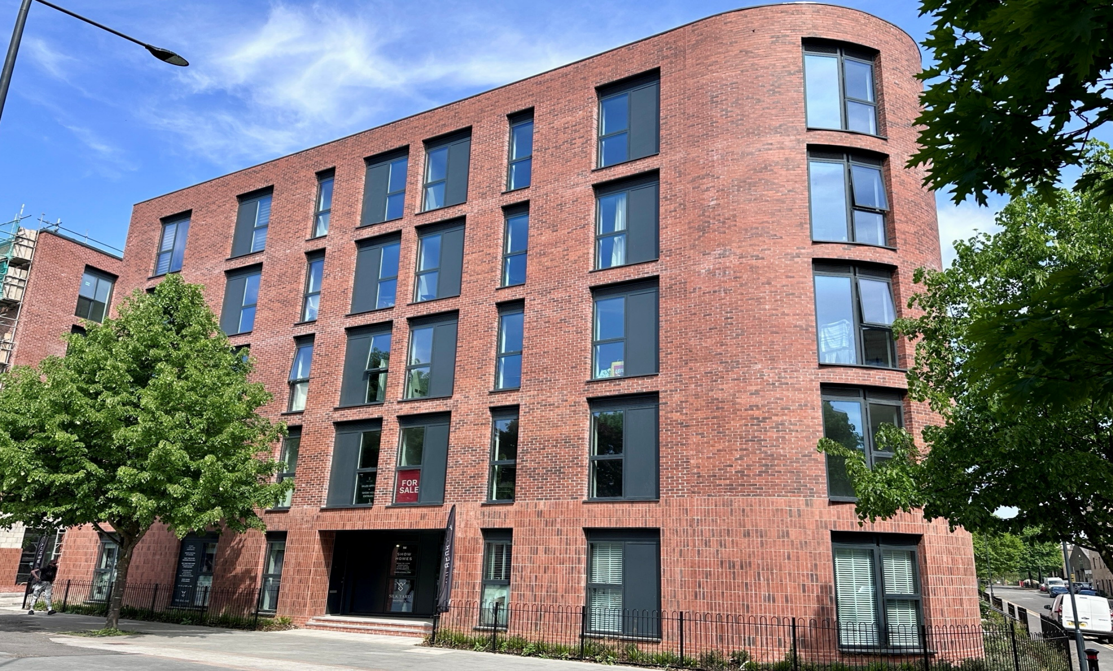
The Silk Yard Liversage Street, Derby, DE1 2LD