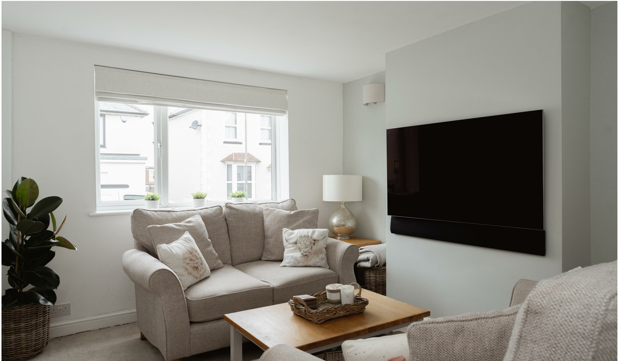
Priory Road, Reigate £400,000