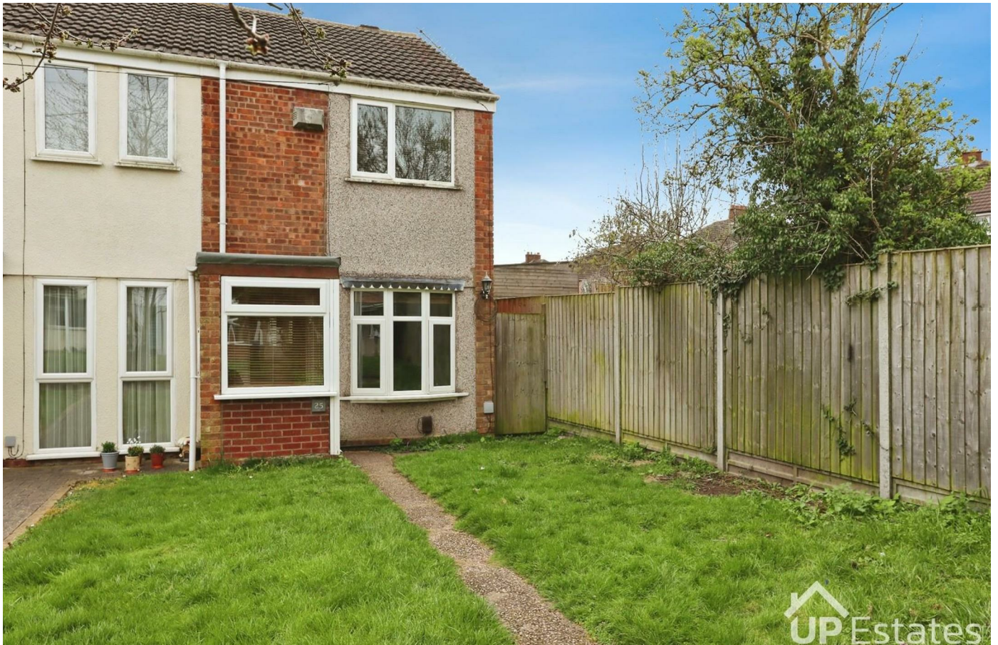
Repton Drive, Coventry