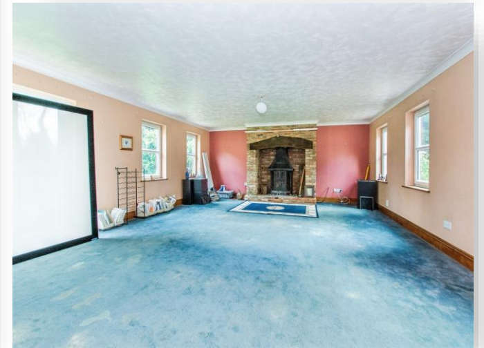
Trafford Park, Wisbech PE13 2DF