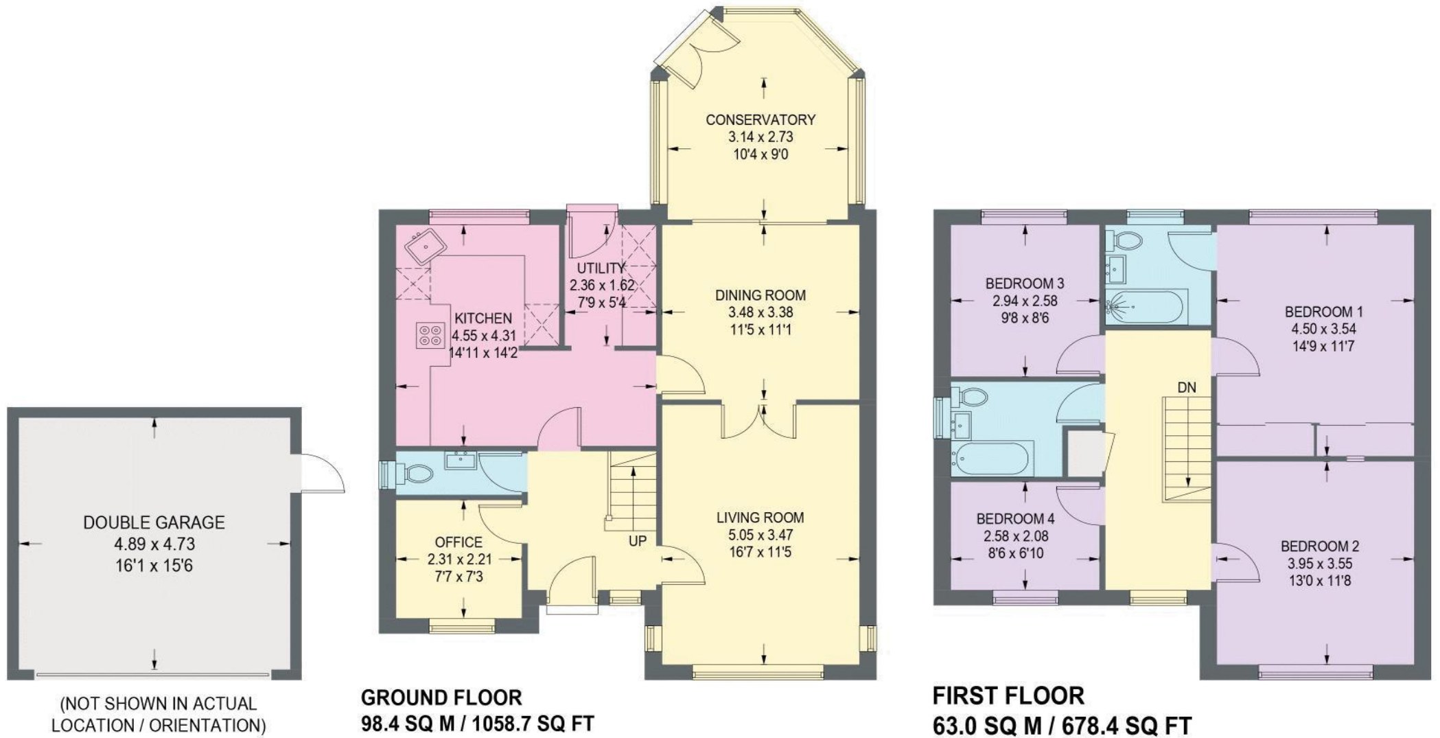
Illustration for identification purposes only, measurements are approximate, not to scale. (ID1298500)

APPROXIMATE GROSS INTERNAL AREA = 161.4 SQ M / 1737.2 SQ FT