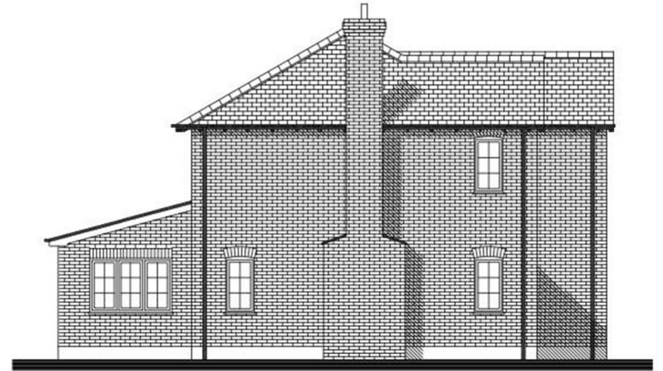
North East - side elevation @ scale 1:50