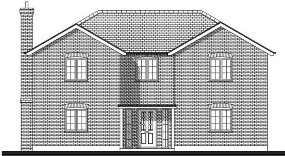
North West - front elevation @ scale 1:50