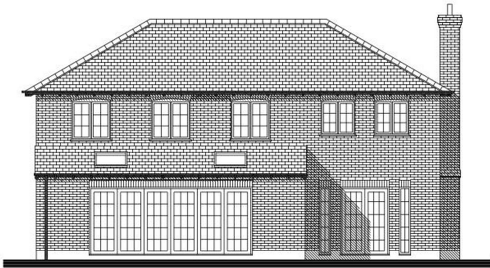
South East - rear elevation @ scale 1:50