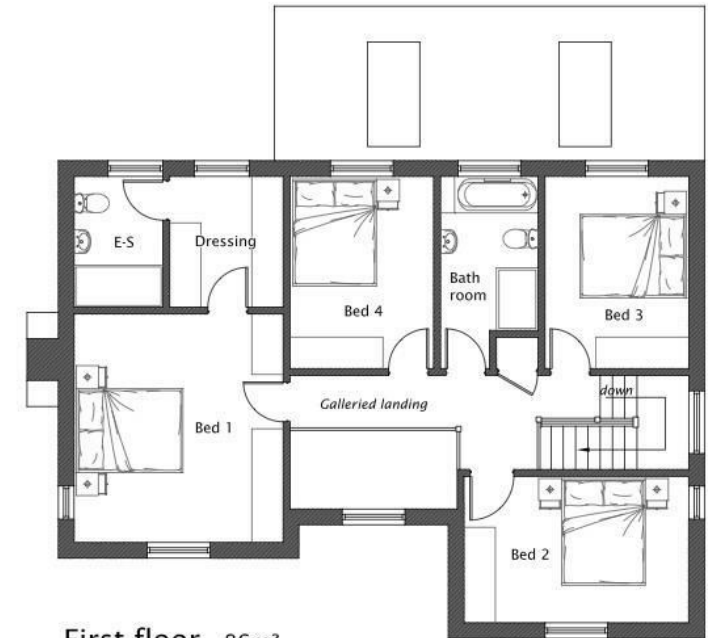
First floor - 86m 2 @ scale 1:50