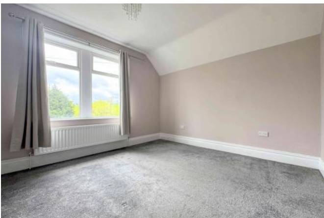
BEDROOM ONE 3.7 x 4.6m (11'11 x 14'11)

A spacious landing with radiators and UPVC windows providing access to all first-floor rooms.