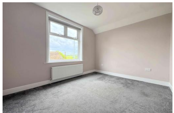
BEDROOM THREE 3.7 x 3.0m (11'11 x 9'8)

A large double bedroom featuring a radiator and a UPVC window enjoying far-reaching hillside views.