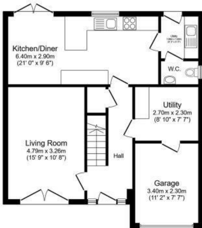
Ground Floor Floor area 65.9 sq.m. (709 sq.ft.)