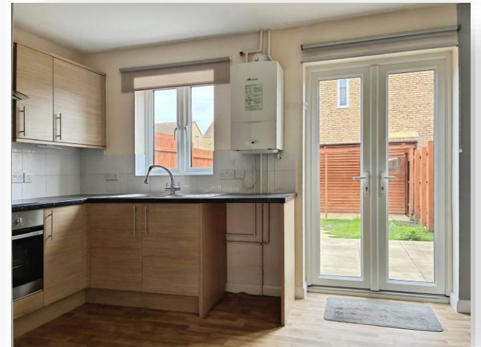
Osborne Road, Wisbech, PE13 3JP