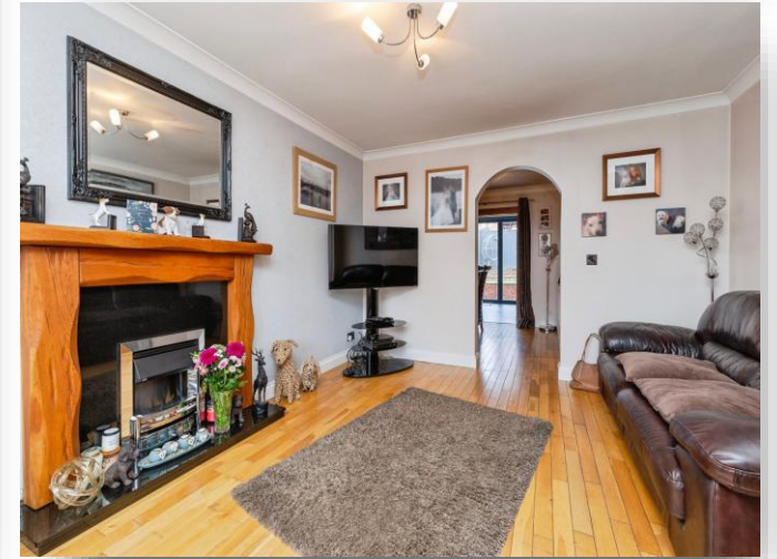
Goldcrest Close, Hartlepool, TS26 0RY