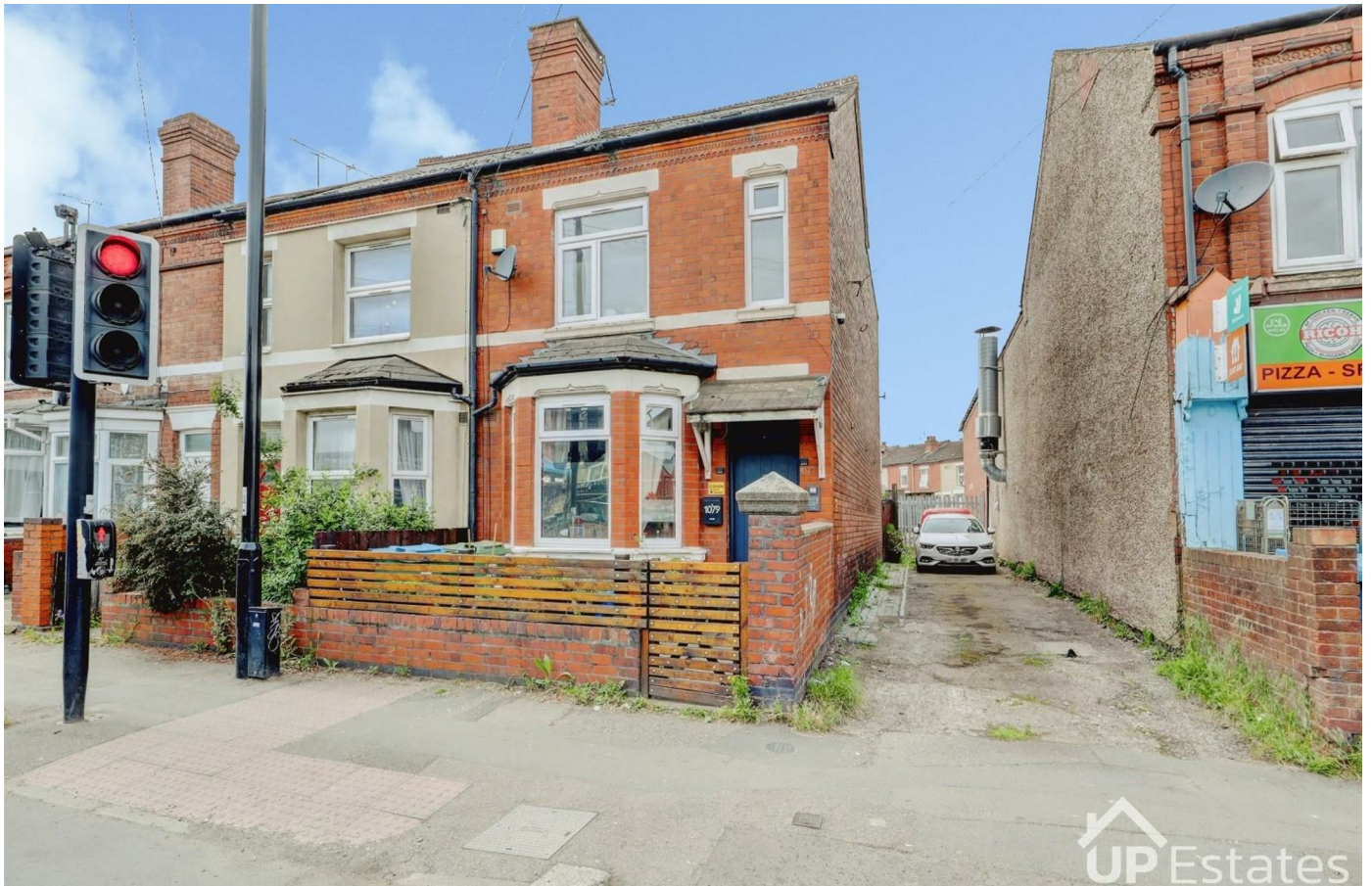
Foleshill Road, Coventry