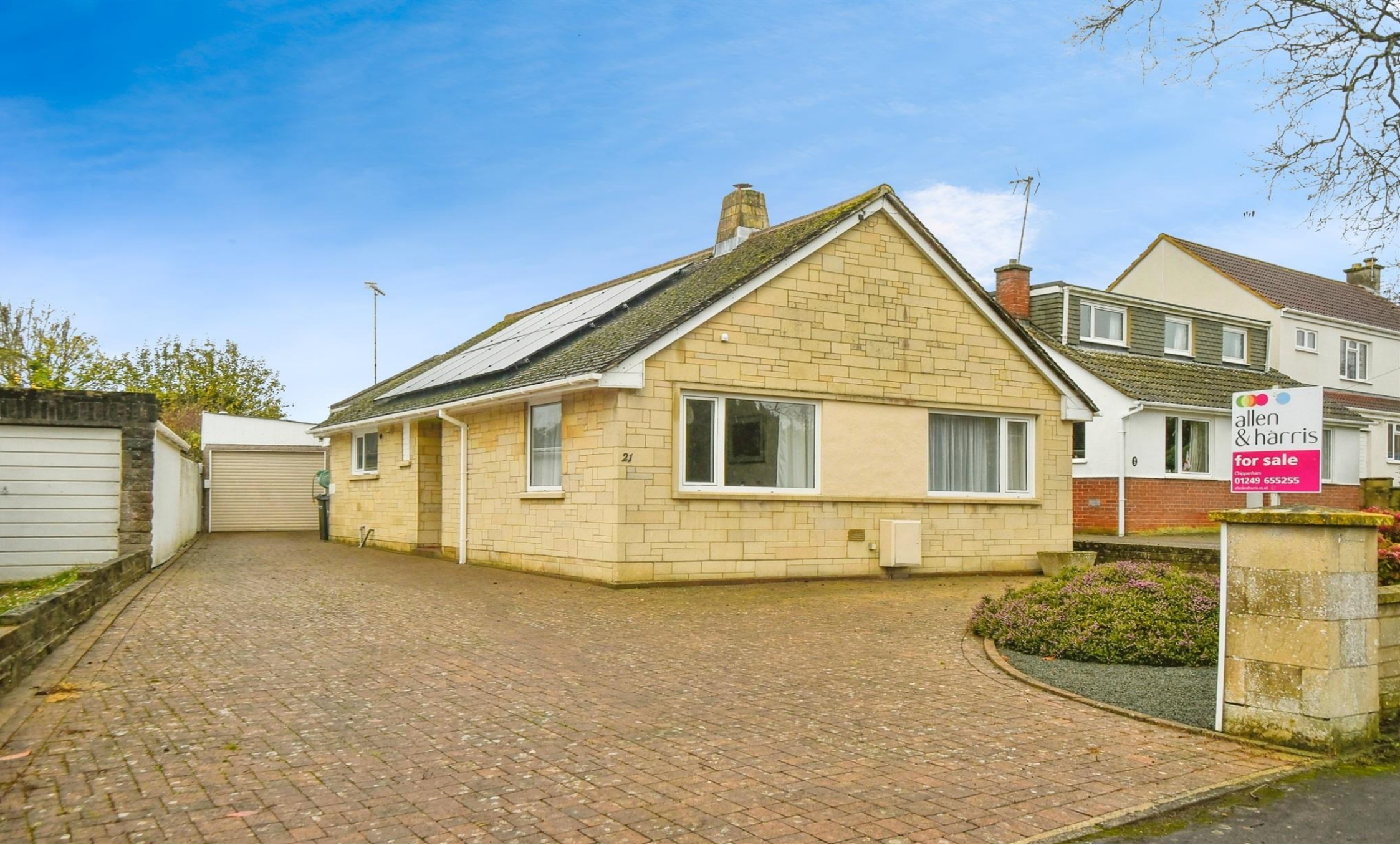
Long Ridings, Chippenham SN15 1PL