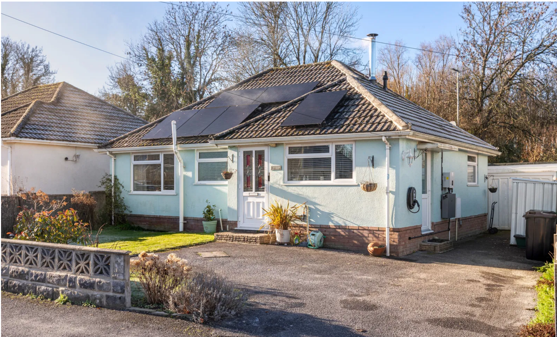
St Georges Close, Dorchester Dorchester