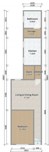
Warwards Lane Ground Floor