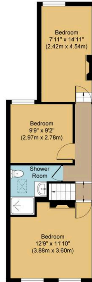
First Floor Approximate Floor Area 466 sq. ft (43.29 sq. m)