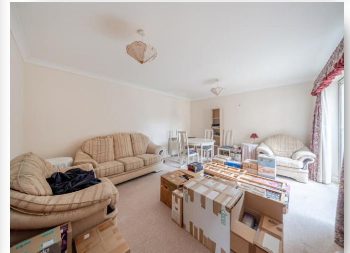
28 Hedingham Mews, All Saints Avenue, Maidenhead SL6 6ET