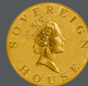
Royal Victor Place, Old Ford Road