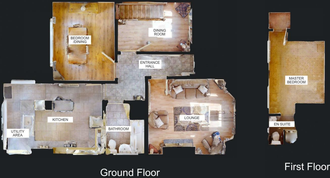
Applewood Crescent, Stoke-on-Trent FLOOR PLAN

For illustration purposes only. Do not scale.