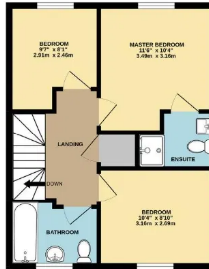
1ST FLOOR 434 sq.ft. (40.3 sq.m.) approx.