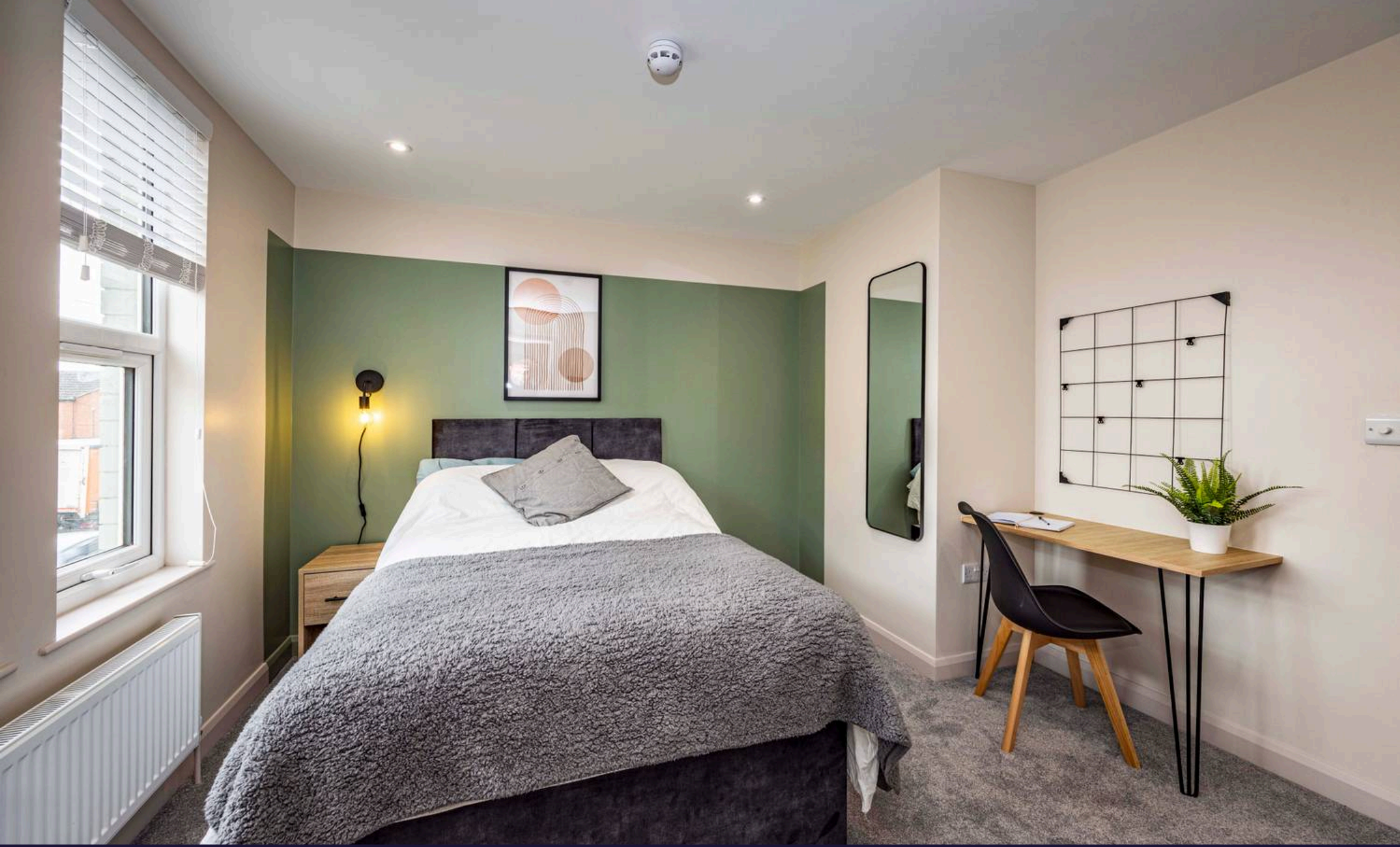
Room 3, Tamworth Road, Long Eaton £625 pcm