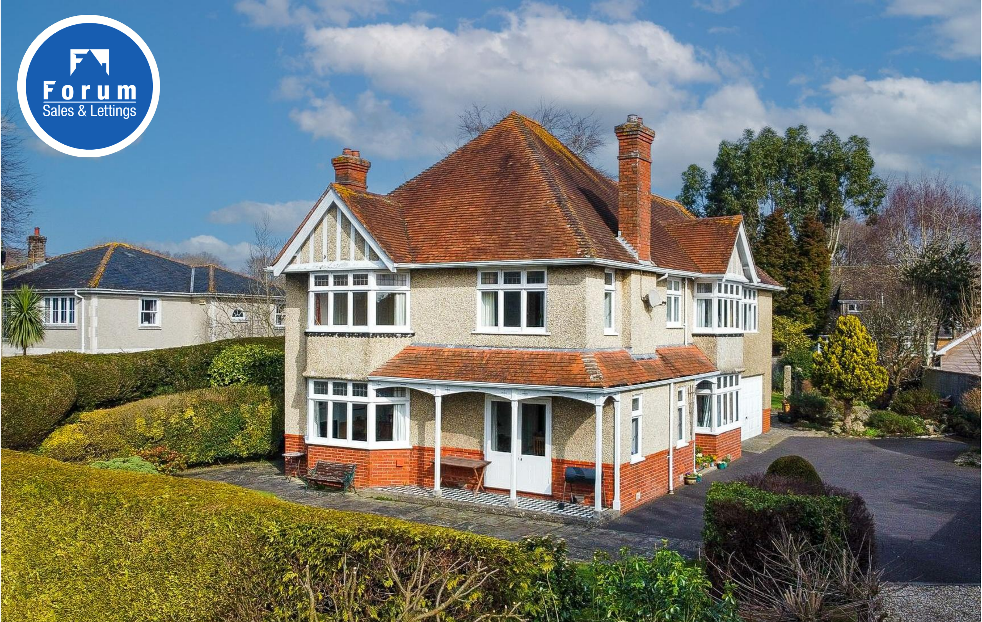
Beech House, Milldown Road, Blandford Forum, Dorset, DT11 7DD