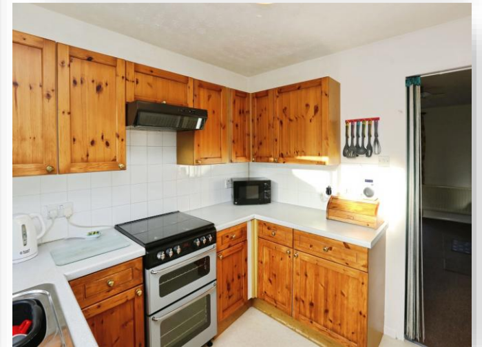
Launceston Drive, Eastleigh. SO50 4QE