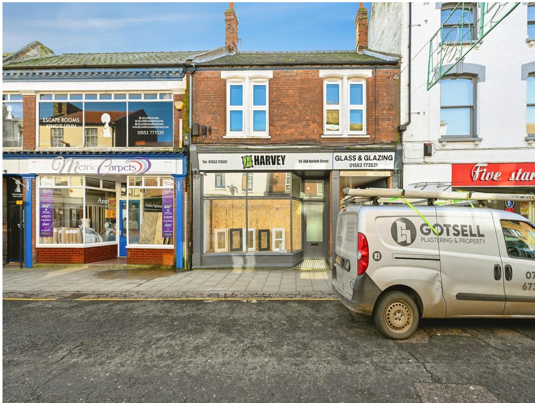
Norfolk Street, King's Lynn, PE30 1AH