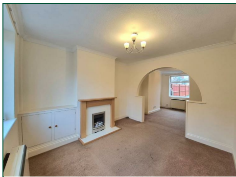
GROUND FLOOR 446 sq. ft. (41.4 sq.m.) approx.