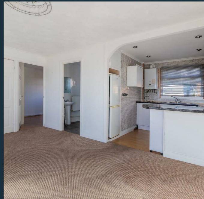
Marconi Holiday Village