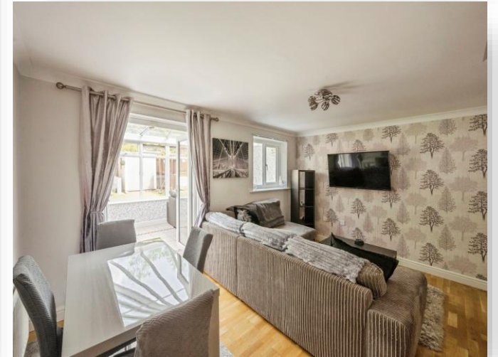
Collier Court, Brampton Bierlow Rotherham S63 6FB