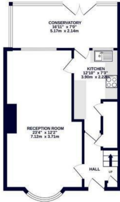
GROUND FLOOR 506 sq.ft. (47.0 sq.m.) approx.