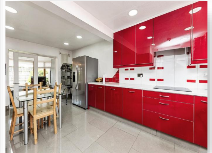
Fairleigh Road, Tingley Wakefield WF3 1PD