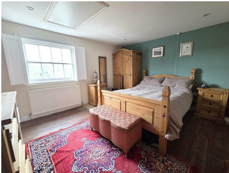
Having a sash window to the front with wooden shutters, loft hatch, radiator and door to the ensuite bathroom.