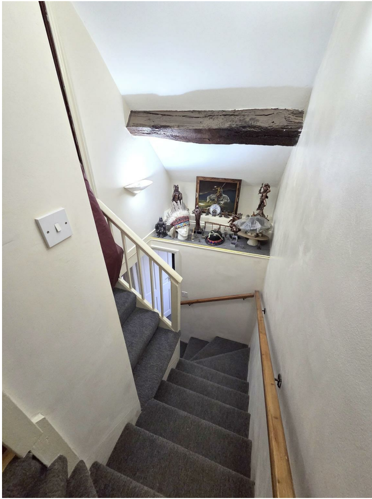
Having a door to bedroom one.