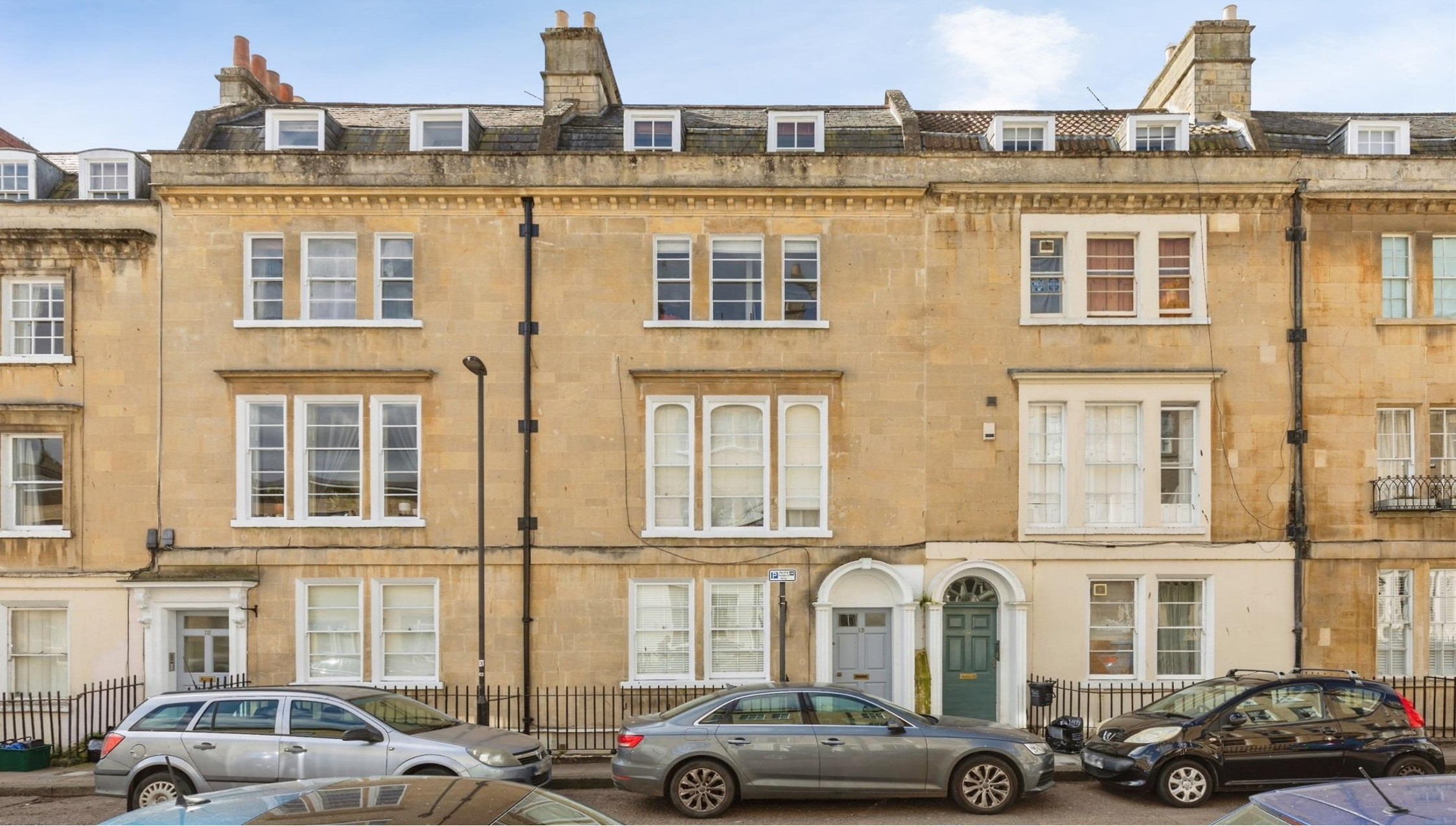
Flat 8 New King Street, Bath BA1 2BL