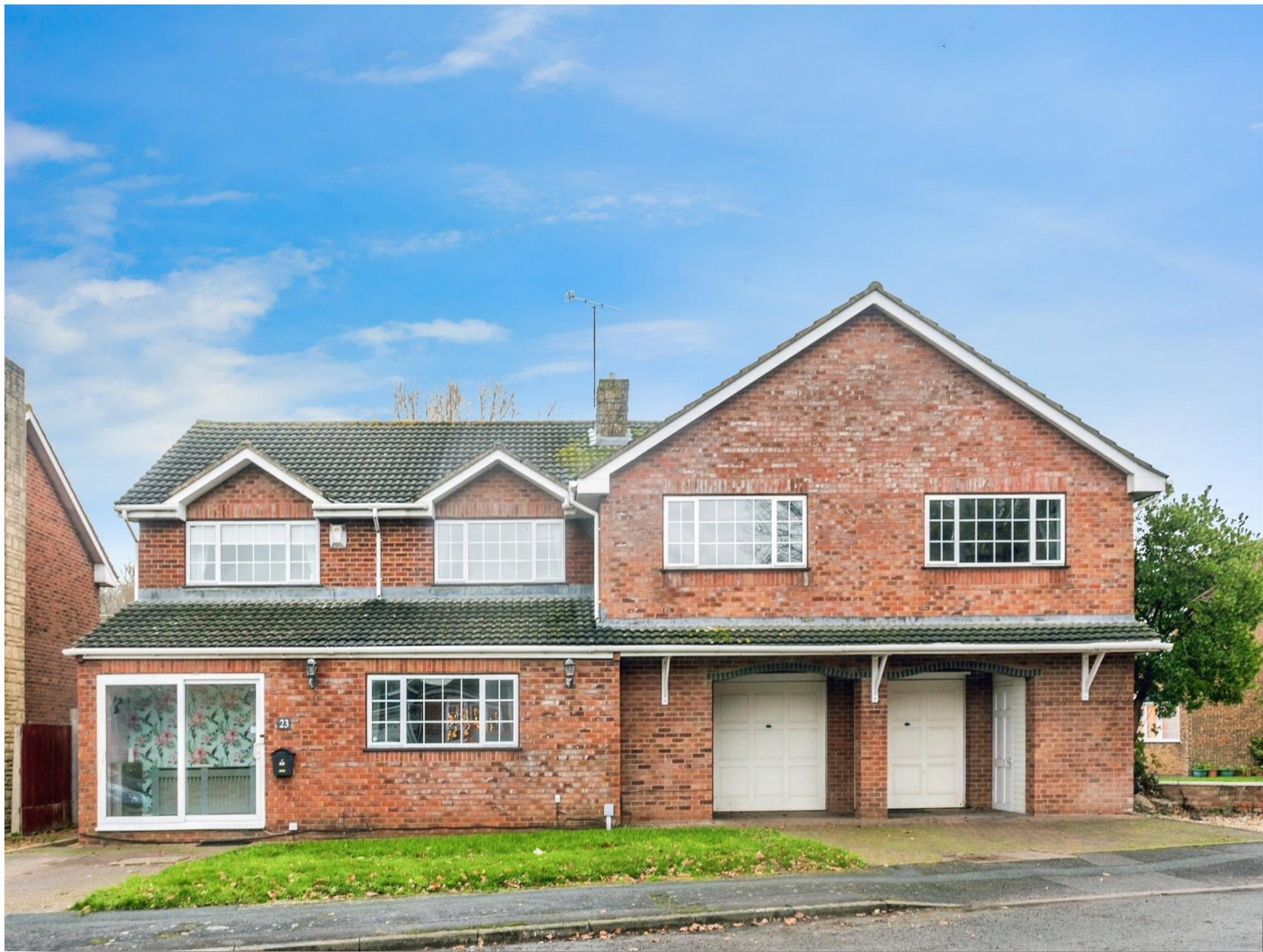
White Edge Moor, Swindon SN3 6LX