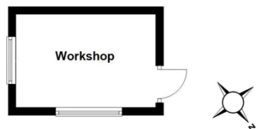
First Floor Approx. 35.3 sq. metres (380.0 sq. feet)