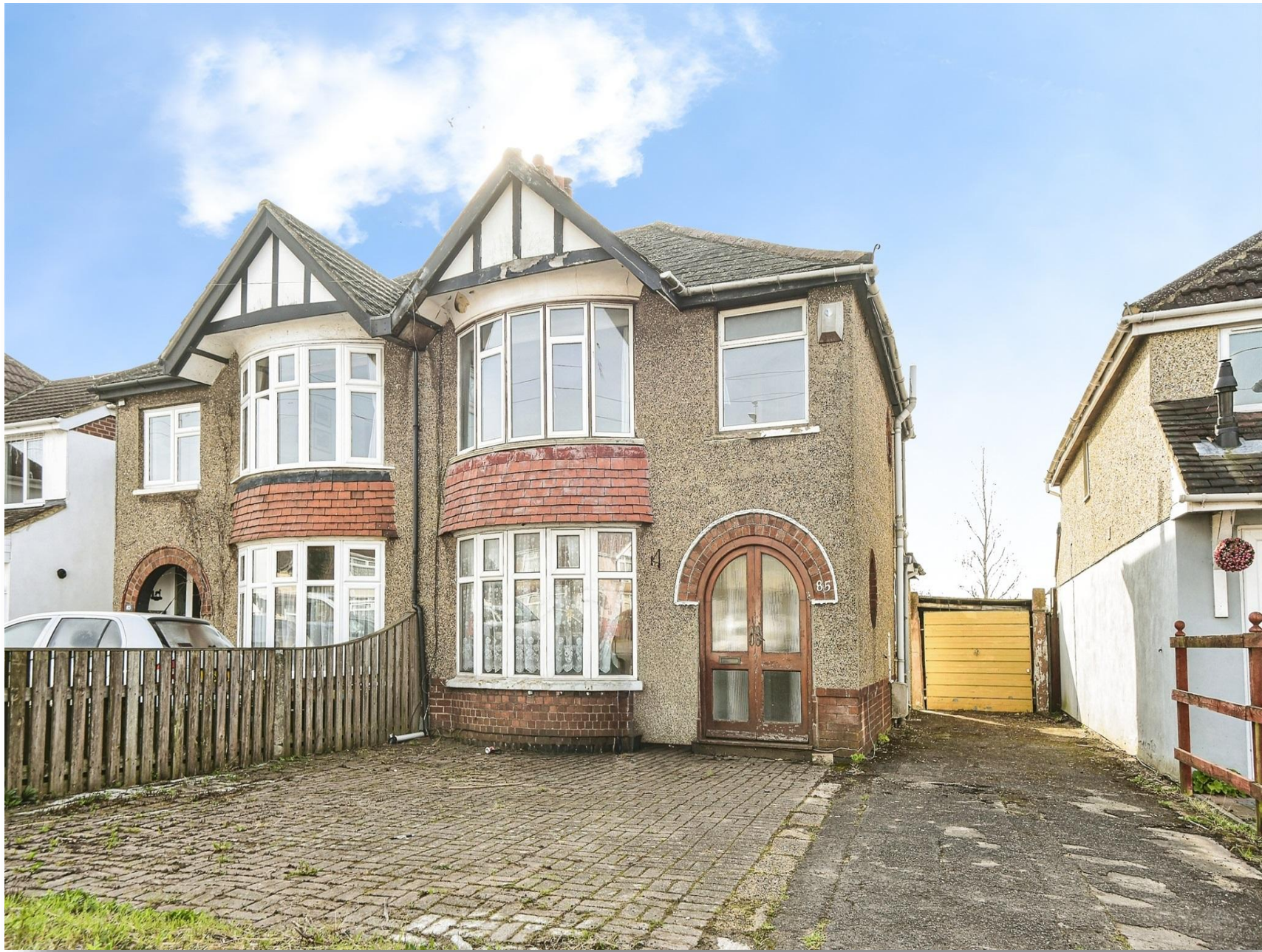
Oxford Road, Swindon, SN3 4JB