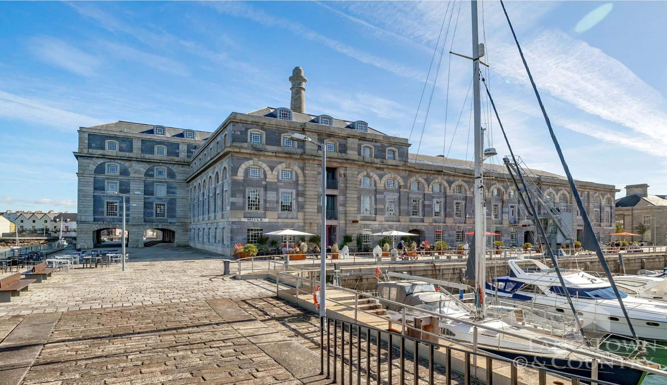
Flat 6 Mills Bakery, 4 Royal William Yard, Stonehouse, Plymouth, PL1 3GD