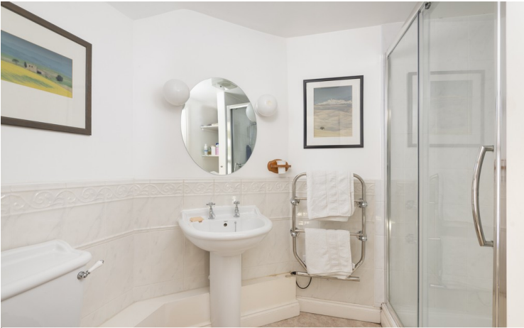
En-suite Shower Room