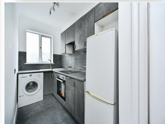
Upper Lewes Road, Brighton BN2 3FH