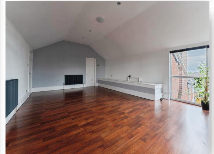
Egerton Park, Rock Ferry, Birkenhead, CH42 4RB