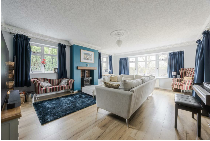
Lounge 20'1" x 16'2" (6.13m x 4.94m)