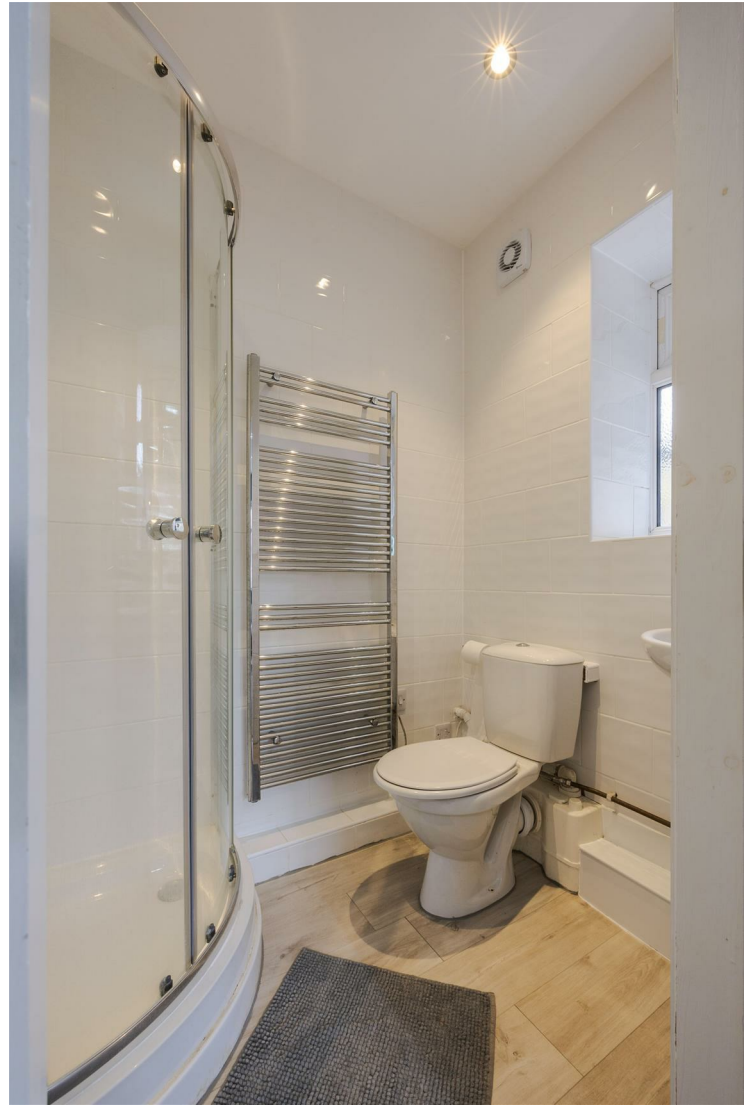
En Suite 7'10" x 7'10" (2.41m x 2.41m)