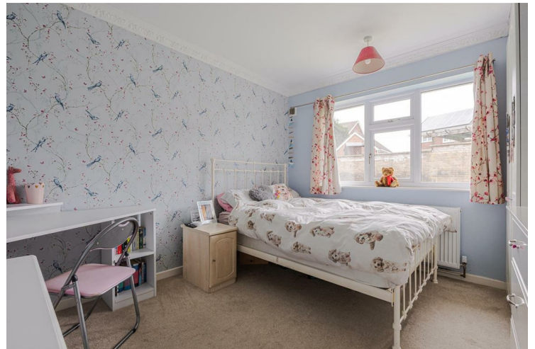
Bedroom three 12'0" x 10'0" (3.67m x 3.06m)