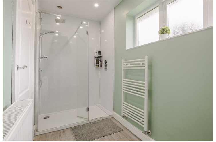
En Suite 11'5" x 5'10" (3.50m x 1.79m)