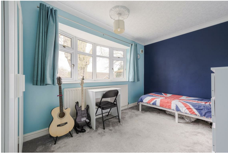
Bedroom four 13'6" x 8'1" (4.12m x 2.48m)