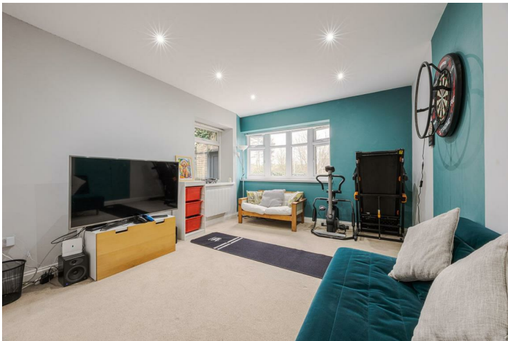
Bedroom five 18'5" x 13'5" (5.63m x 4.11m)