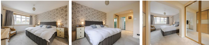
Bedroom one 11'10" x 11'5" (3.62m x 3.50m)