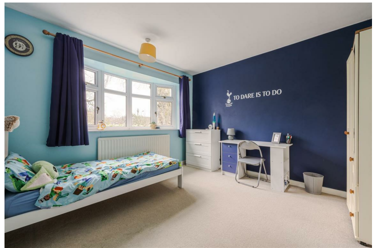
Bedroom two 11'10" x 11'10" (3.62m x 3.62m)