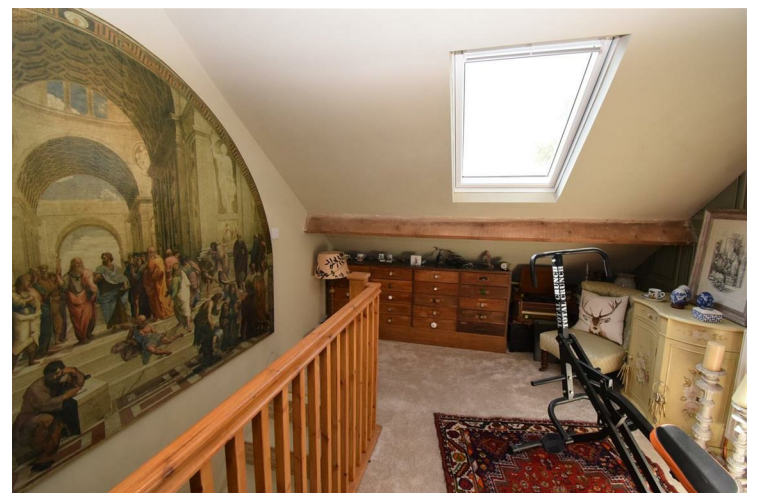
Loft Area 10'11" x 9'10" (3.34 x 3.00)

The remaining part of the garage is now a useful storage area. With electric light and power connected and an electric roller door.