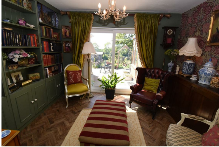
Sitting Area 11'11" x 8'5" (3.64 x 2.59)

With luxury vinyl tile flooring, a radiator, double glazed sliding patio door to the rear patio and garden and a fitted bookcase with a hidden door leading to: