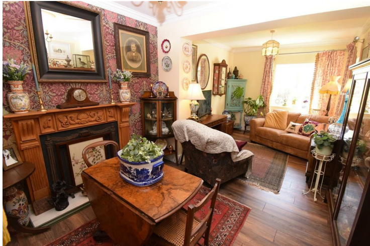
Living Room/Bedroom 3 19'3" x 9'4" (5.89 x 2.85)

Versatile extended living room or potential third bedroom. With a feature fireplace, laminate flooring, radiator, decorative coving to the ceiling and double glazed side and rear windows. Glazed door to: