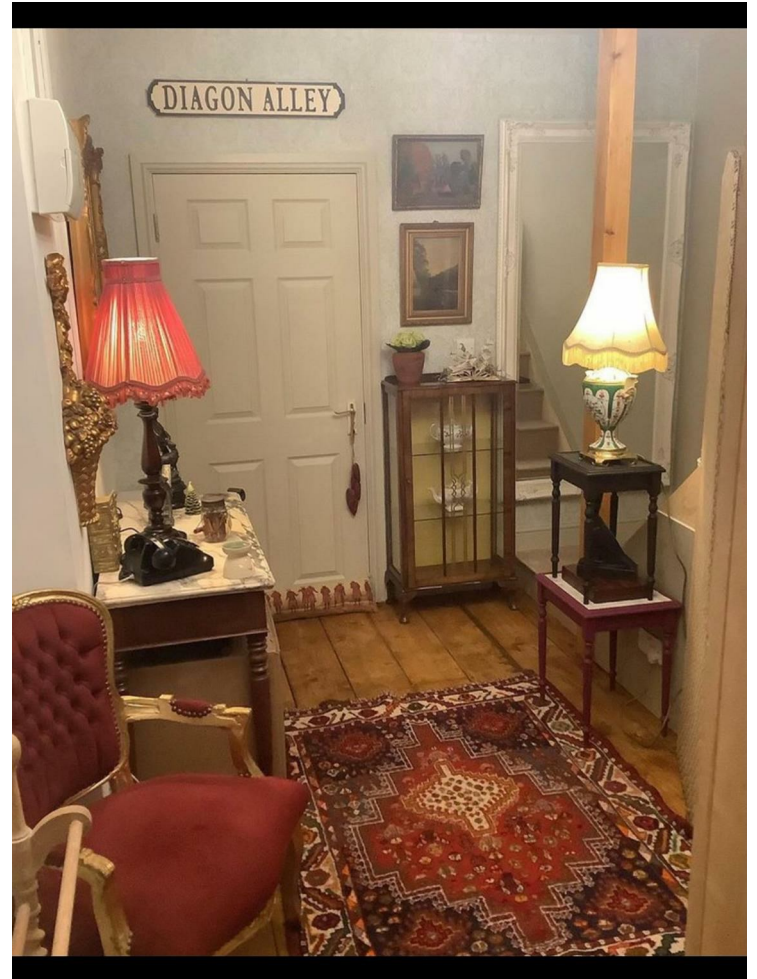
Utility 12'0" x 9'10">8'10" (3.66 x 3.00>2.71)

Originally part of the garage; with plumbing for a washing machine, a radiator, wood flooring, stairs to the loft area and a door to: