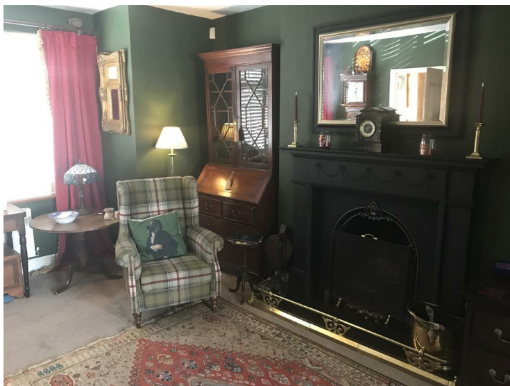
Lounge Area 16'11" x 11'11" (5.16 x 3.64)

With a decorative open fireplace, radiator and double glazed front window with shutters.