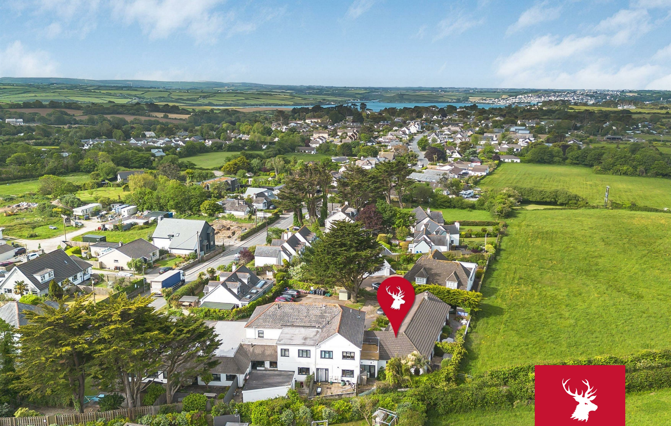
Flat 2, Trelawney Court