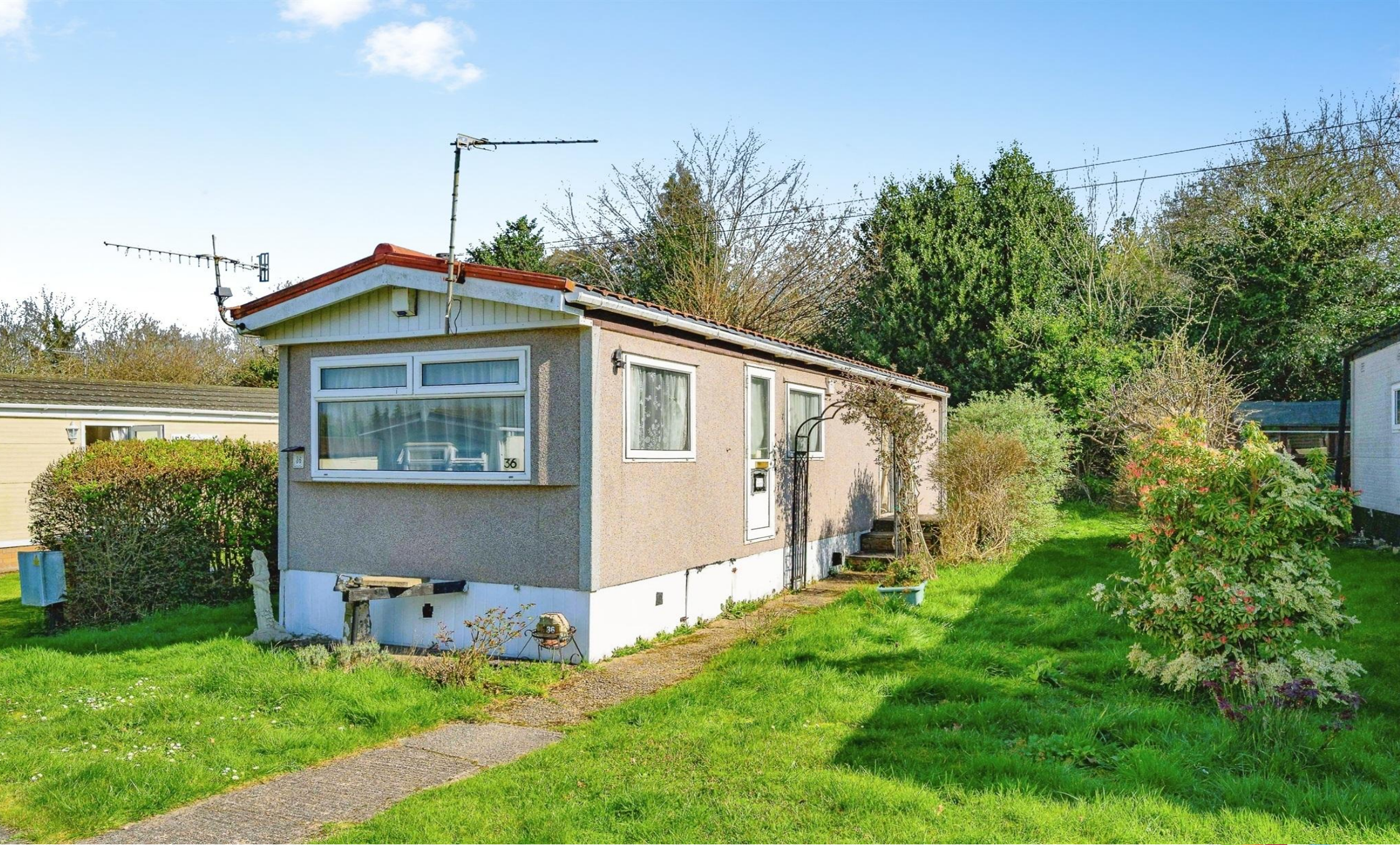
Newlands Park Caravan Site Bedmond Road, Abbots Langley WD5 0RR