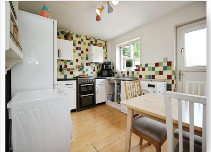
Atha Close, Leeds LS11 7DA