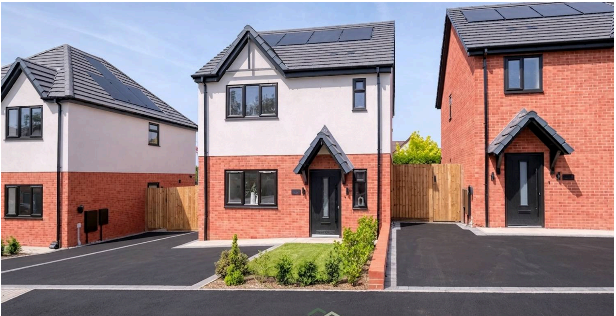
The Chestnut Ailstone Mews, Lickey End Bromsgrove